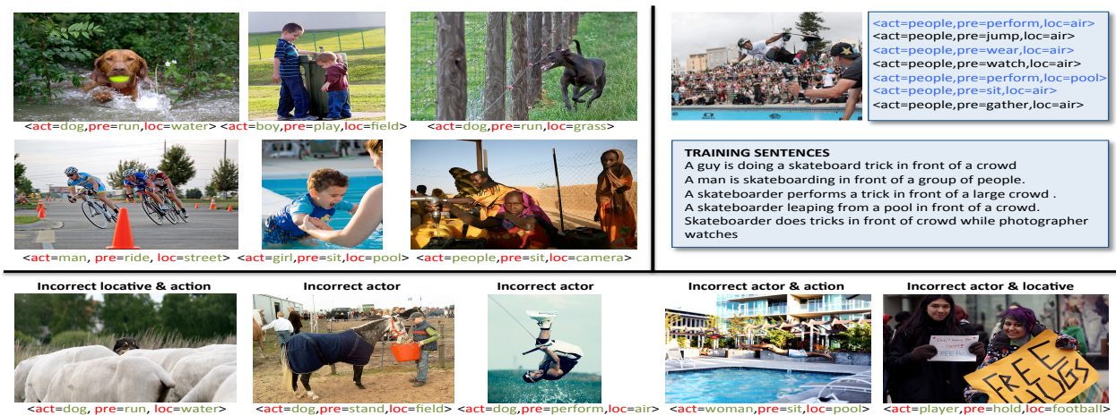
Figure 2: Samples of predicted tuples. Top-left: Examples of visually correct predictions. Bottom: Typical errors on one or several arguments. Top-right: Sample image and its top predicted tuples. The tuples in blue were not observed neither in the SP-Dataset nor in the automatically enlarged dataset. Note that all of them are descriptive of what is occurring in the scene.

ysis approach of Hodosh et al. (2013). We first note that this approach is able to rank a list of candidate captions but cannot directly generate tuples. To generate tuples for test images, we first find the caption in the training set that has the highest ranking score for that image and then extract the corresponding semantic tuples from that caption; 3) Indicator Features (IND), this is a standard factorized log-linear model that does not use any feature representation for the outputs; 4) A model that uses the skip-gram continuous word representation of outputs (SCWR); 5) A model that uses that semantic equivalence representation of outputs (SER); 6) A combined model that makes predictions using the best feature representation for each argument type (COMBO).